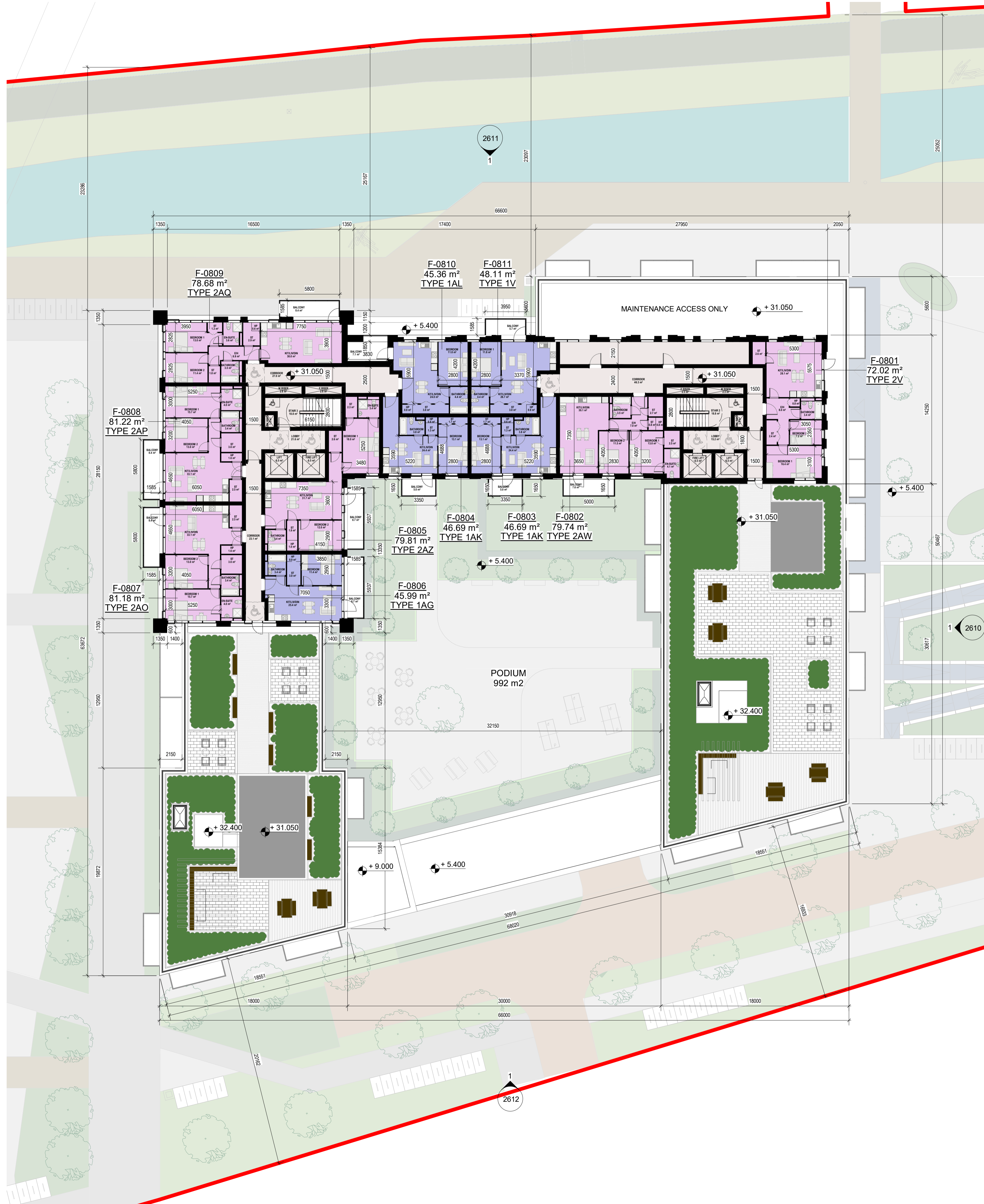
1 PLAN - BLOCK F - LEVEL 08 1 : 200

Please consider the environment before printing this sheet